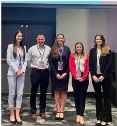
Students at the fall 2023 PSPS Conference