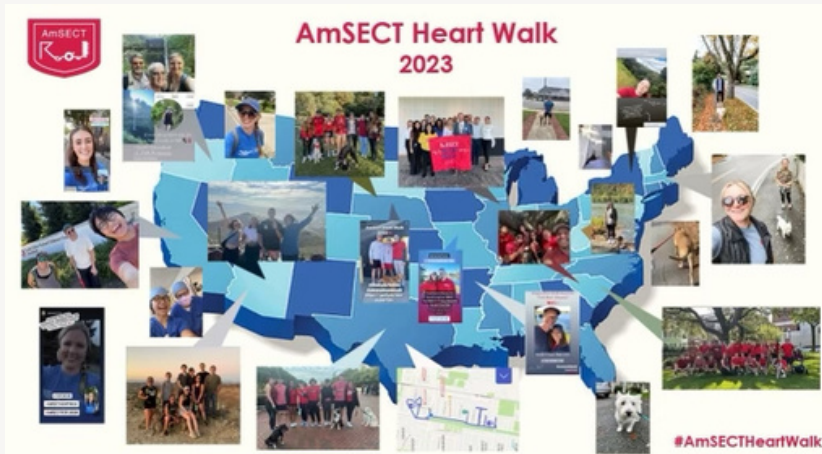
AmSECT student council Heartwalk Fundraiser 2023. Thank you to everyone who donated!