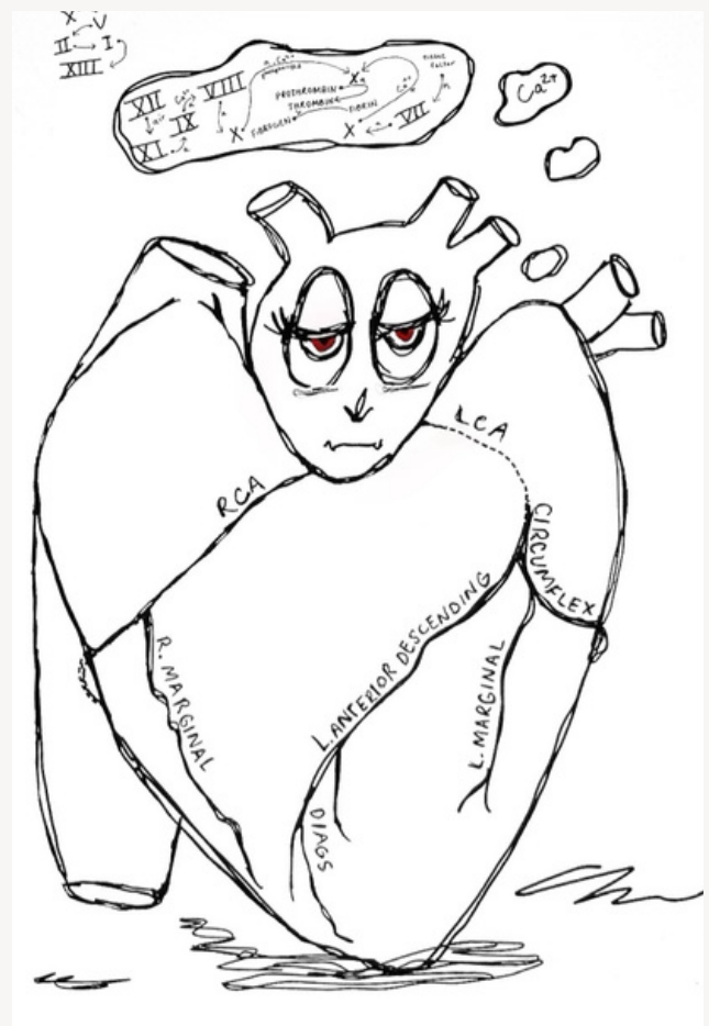
Submission by Charlotte Clonts